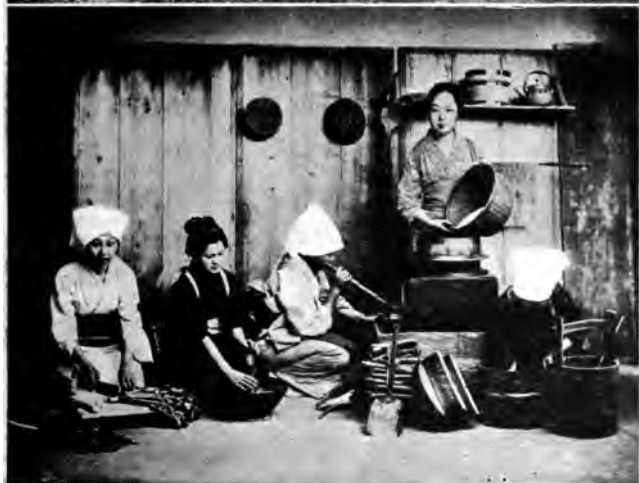
SPINNING COTTON THREAD FOR WEAVING AT WORK IN A KITCHEN